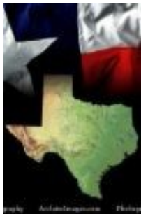
Serving Central Texas

We would like to introduce The Davis Law Firm's Title Division. As you may already know, we do things a little differently than most. We do them right. We know that your reputation is at stake every time you refer your client to a company. We are here to make you look good. Closing doesn't have to be complicated or problematic. We are not only here for your clients, we value you as an individual as well. We love compliments, but your suggestions are just as valuable to our Firm. Change is good and we hope you make the change and remember us for all your title needs.